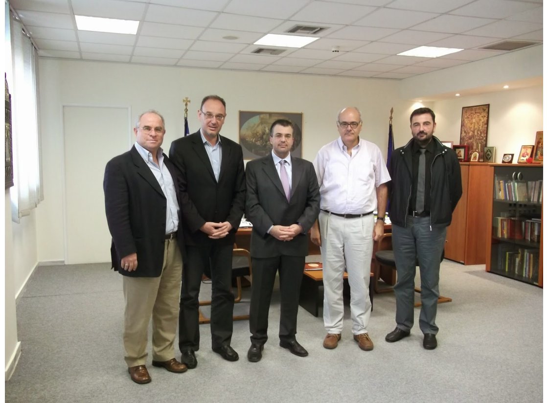
Minister of Education