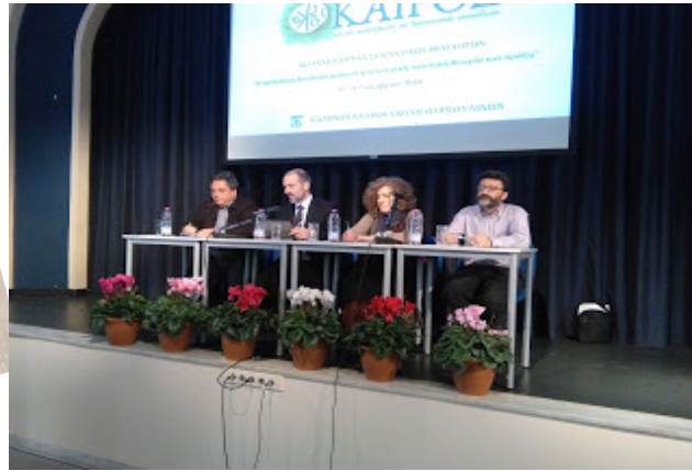
2nd Conference , Athens, November 9-11, 2018