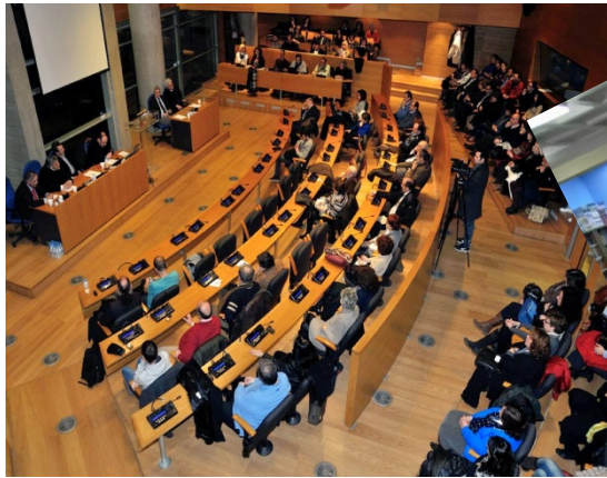
Religious Education in modern school (Thessaloniki, 2014)