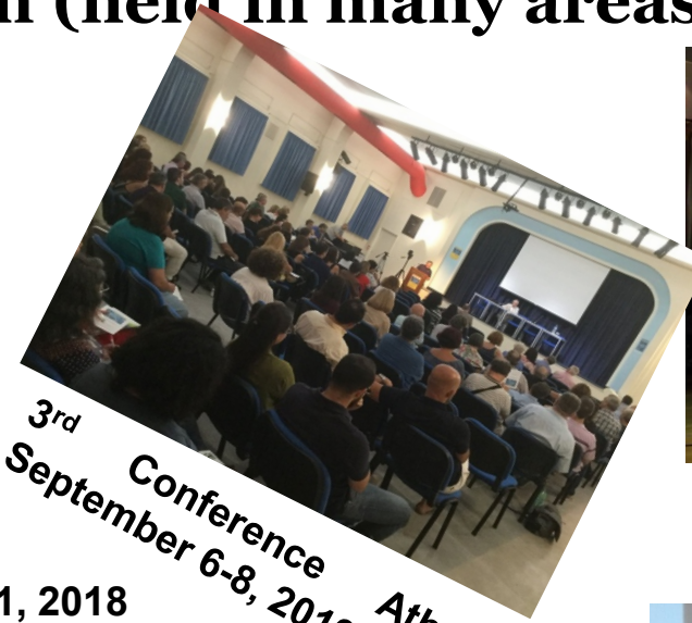
3rd Conference September 6-8, 2019 Athens,