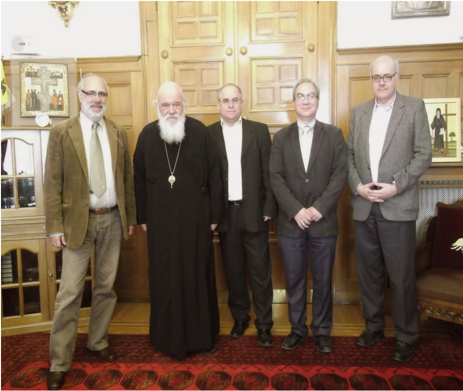
Ieronymos II is the Archbishop of Athens and All Greece