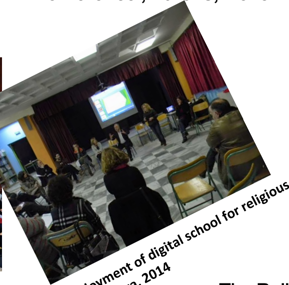
The employment of digital school for religious education, Patra, 2014