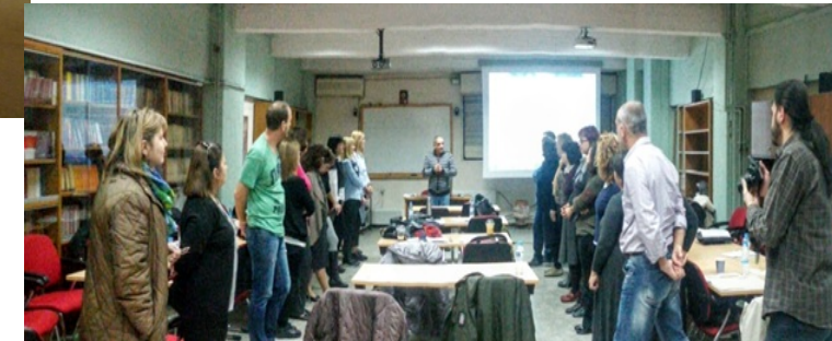
Faculty of Theology, Aristotle University of Thessaloniki, 10/2016