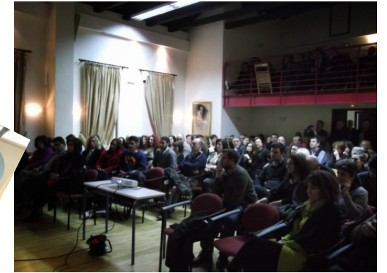
Municipality of Argos Orestiko, Kastoria